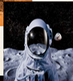
4. An astronaut