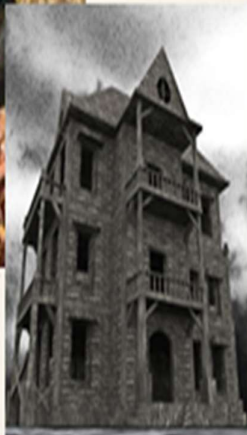
2. An abandoned house