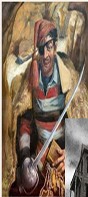
1. A pirate

Choose one of the images on this sheet to base your description on!