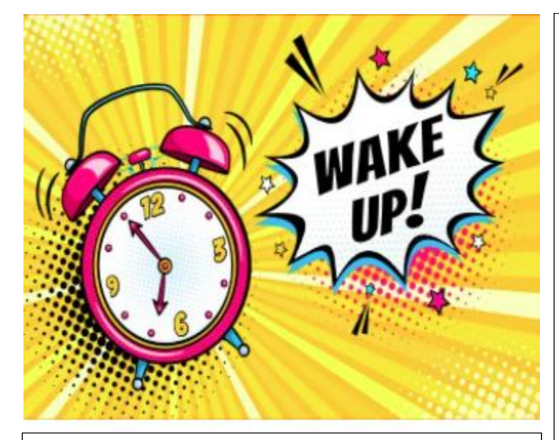
VIRTUES AWARD - VIRTUES TO LIVE BY