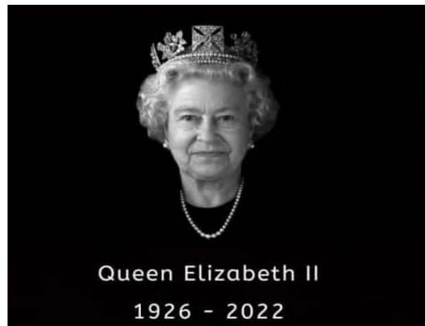
Queen Elizabeth II 1926 - 2022