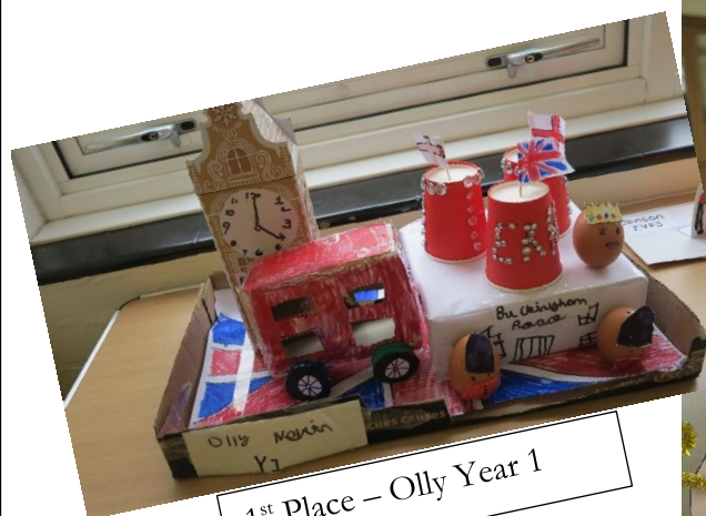
1 st Place – Olly Year 1